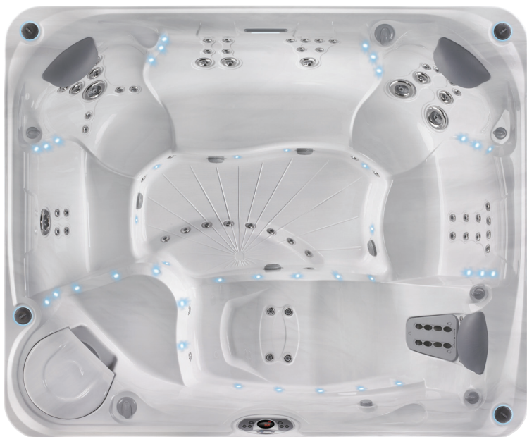
Shown with Sterling Marble shell