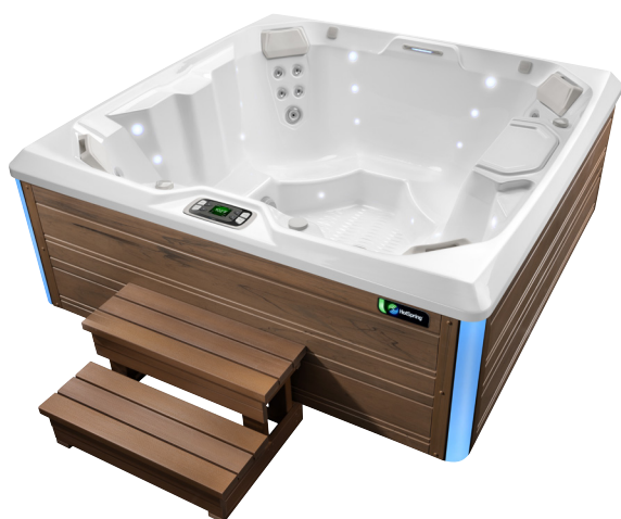
Beam shown with Alpine White shell & Sable cabinet